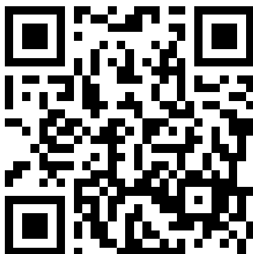
Google Form QR code